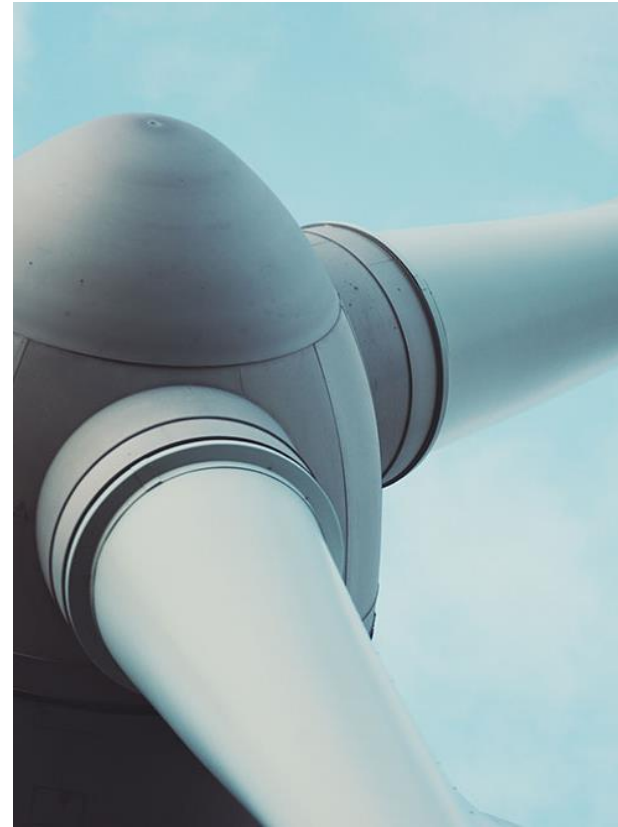
Energy & infrastructure